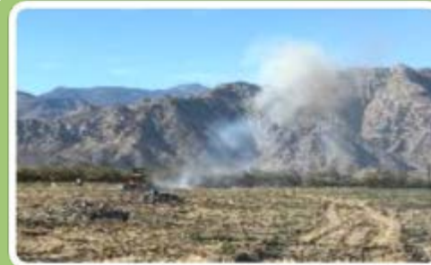
Open Burning & Illegal Dumping