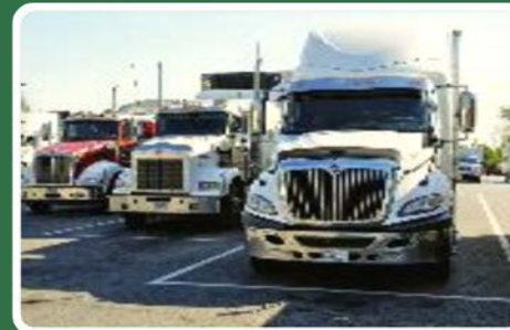
Diesel Mobile Sources