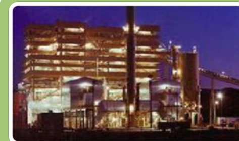
Greenleaf Desert View Power Plant