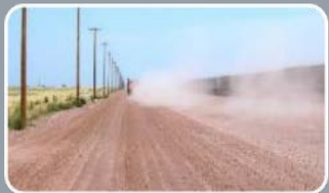
Fugitive Road Dust & Off-Roading