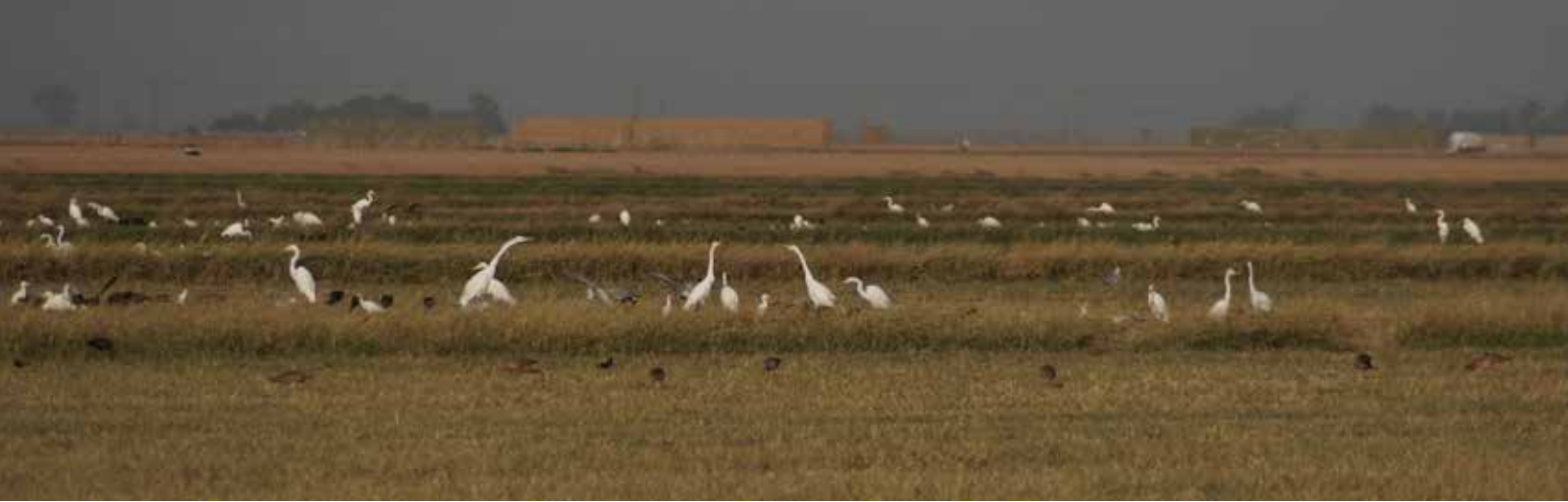
GREAT EGRETS and other birds foraging in the Imperial Valley south of the Salton Sea. Jonathan Nye

shoreline while allowing the central basins to increase in salinity. Proposals for pumping in fresh water or desalinated from elsewhere—typically envisioned as influx from the Gulf of California—are currently under consideration with the Salton Sea Management Program.