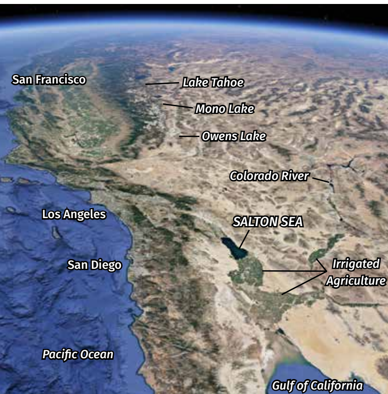
FIGURE 1.1 Viewing the Salton Sea in its western North America regional context reveals its critical position for water birds migrating lake-to-lake along the Pacific Flyway as well as the vastness of irrigated agricultural lands to the south. Sarah Simpson. Source: Google Earth

To avert potentially substantial externalities to both environmental and human health, the Salton Sea Authority created a 10-year management plan. Numerous governments, non-governmental organizations, and local stakeholders prepared this plan, which relies on a mixture of new wetland construction and water quality control (Forney, 2018). Wetlands naturally grow as the shoreline recedes. These vegetated wetlands are primarily supplied by surface water inflows from the New and Alamo Rivers and expected to support invertebrates, rails, and migrating geese. Intentional construction of estuarine wetlands or impoundments are being developed on the northern and southern shorelines with freshwater combined with the Sea's already salty water in the hope of supporting fish and fish-eating birds. In the future, more extreme measures may be taken to control salinity and water quality. Desalination plants could be constructed, or freshwater flows could be diverted to the