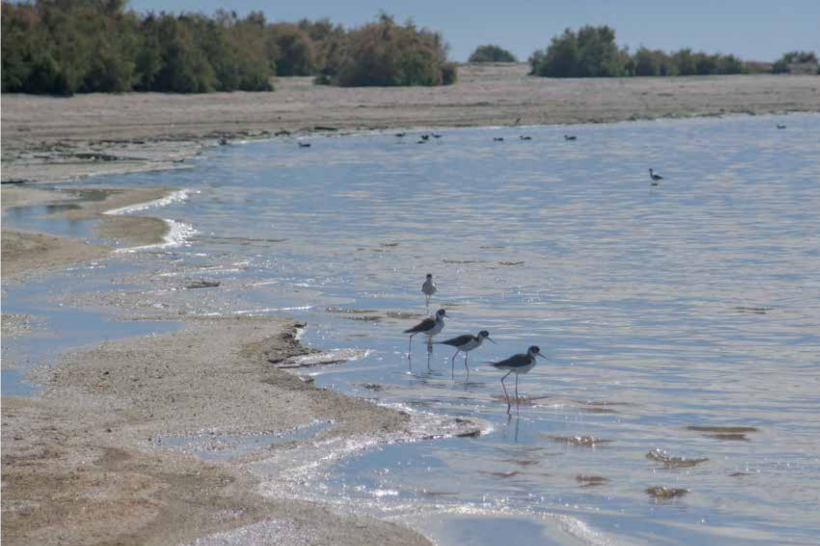
BLACK-NECKED STILTS foraging along the receding shoreline near North Shore Yacht Club. Jonathan Nye

concept. Indeed, more than two decades have transpired since the introduction of the water transfer between the Imperial Irrigation District and the San Diego County Water Authority that would become the 2003 Quantitative Settlement Agreement (Littleworth and Garner, 2019), yet little has been accomplished.