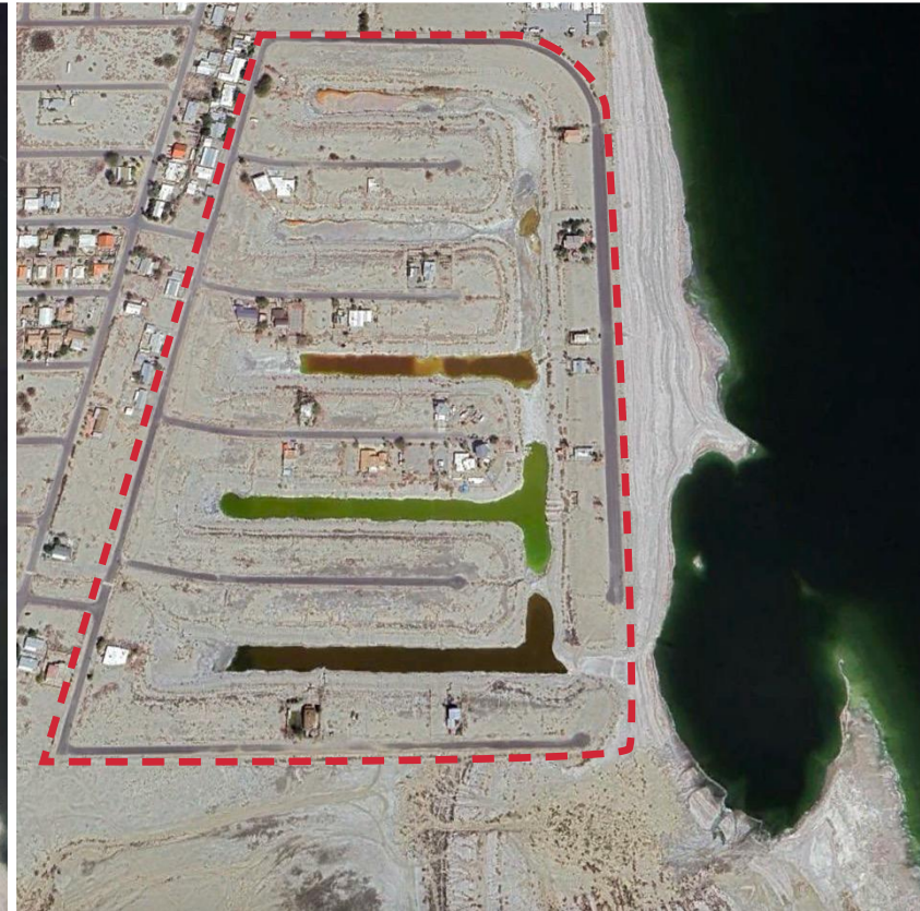
Historical Photos from Google Earth