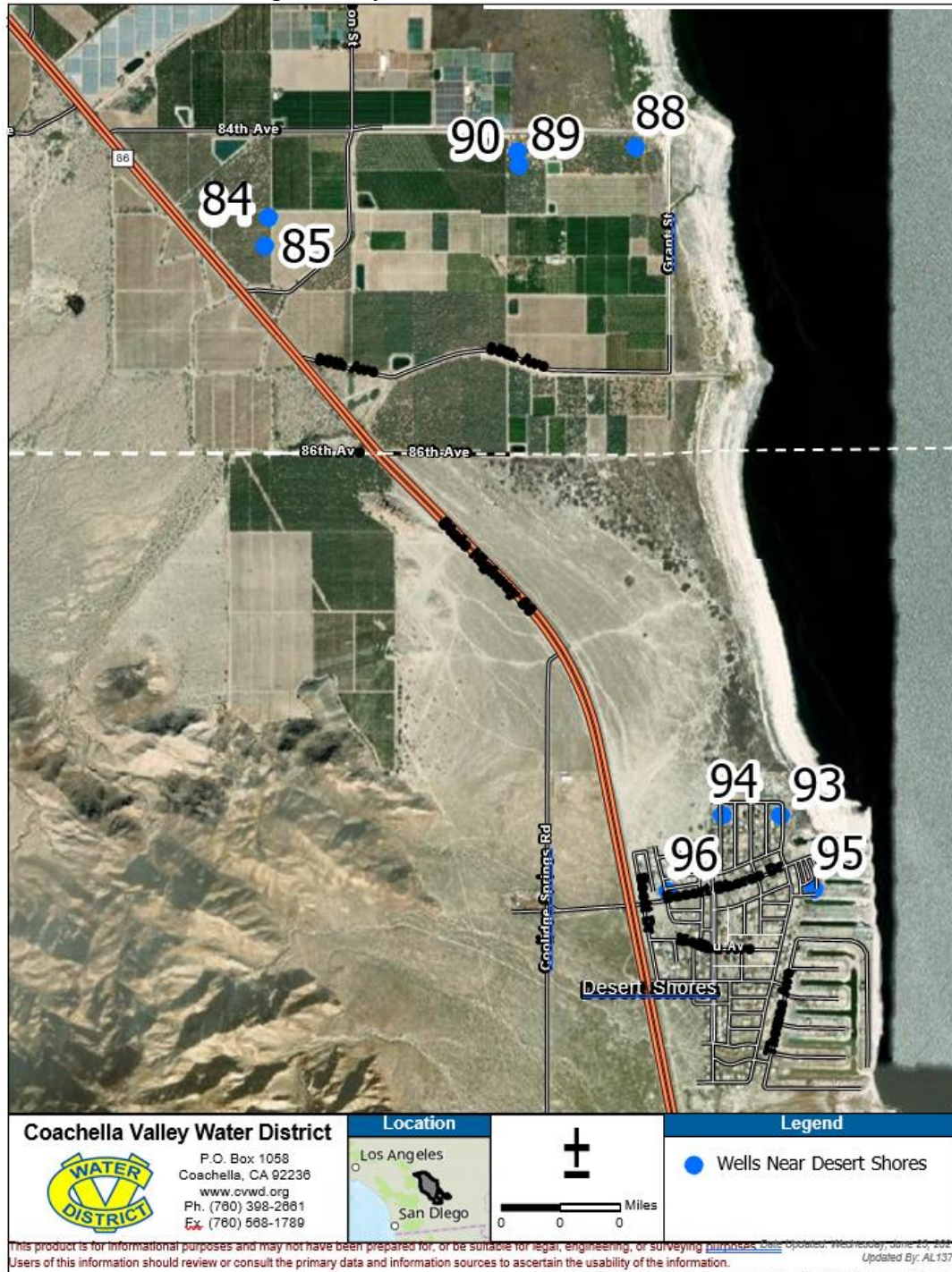
Figure 2. The attached Coachella Valley Water District map provides the location of each aforementioned well in proximity to Desert Shore.